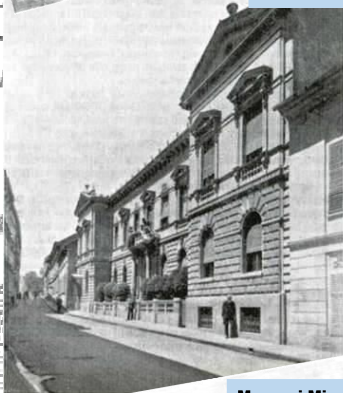
DGT Danube Steamboat Companys' Headquarter In the early 20th and today