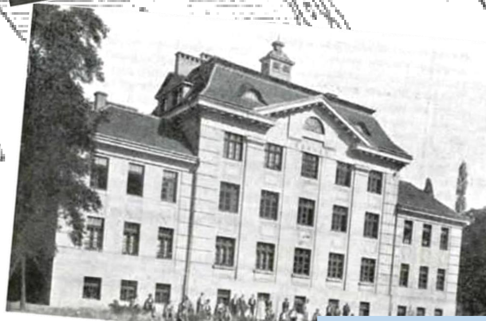
Istvánakana Miner Hospital