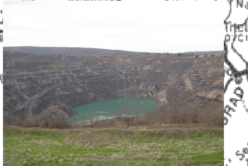
Pécsbánya Miner Lake and Pécsbánya (today)